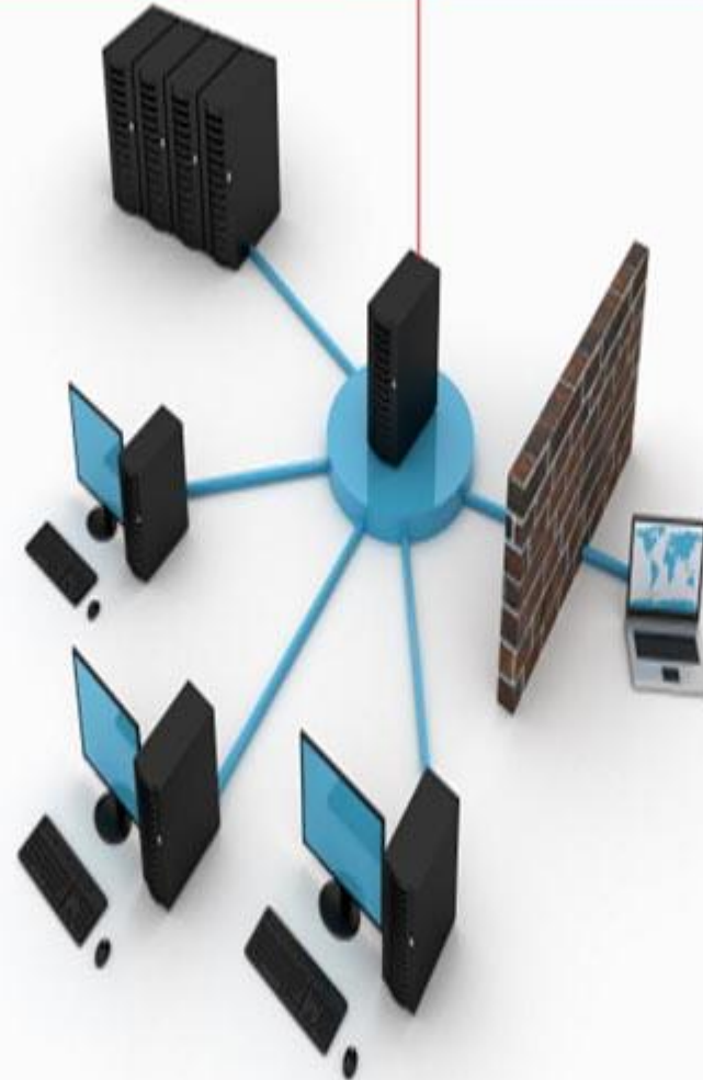
Local Computer Network