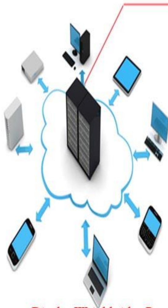
Display Weighbridge Report On Cloud and via SMS and Email